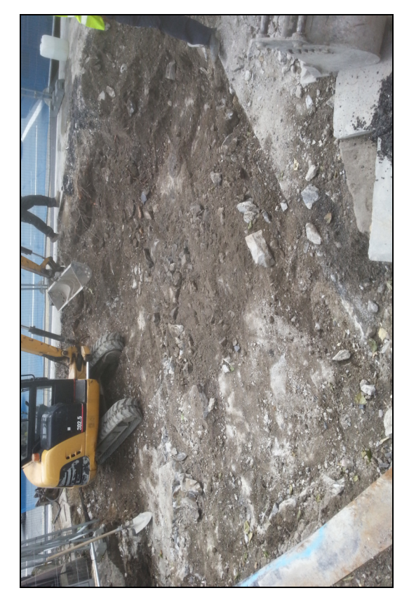
Plate 8: Westmoreland St.; Thomas Moore statue; view of area following removal of foundation.