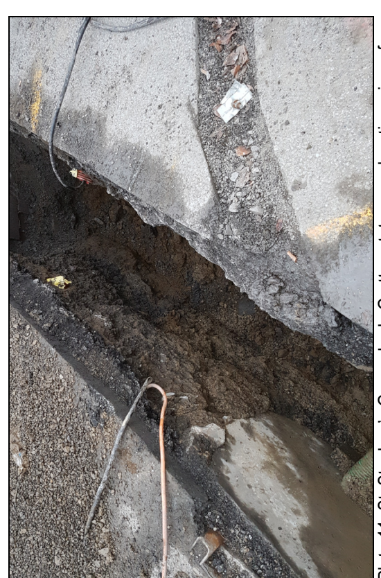
Plate 11: St. Stephen's Green; Lady Grattan statue new location; view of watermain trench