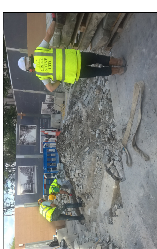
Plate 9: O'Connell St. Upper; Fr. Mathew statue; view of plinth foundation.