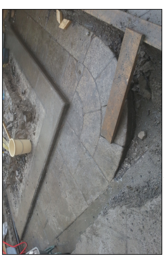
Plate 7: Westmoreland St.; Thomas Moore statue; view of old street paving following removal of statue.