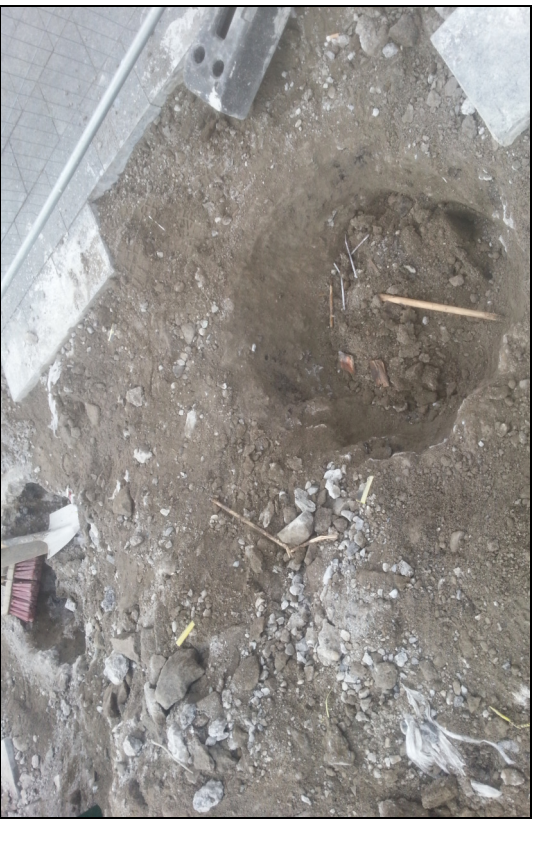
Plate 2: O'Connell St. Upper; Parnell National Monument; view of area following removal of bollards