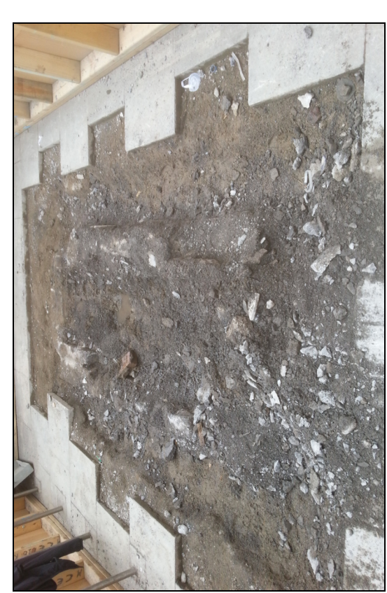
Plate 3: Grafton St.; Molly Malone statue original location; view of plinth foundation