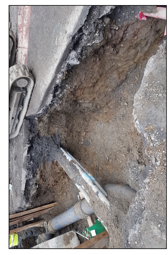
Plate 12: St. Stephen's Green; Lady Grattan statue new location; view of foundation trench