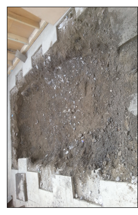
Plate 4: Grafton St.; Molly Malone statue original location; view of area following removal of foundation.