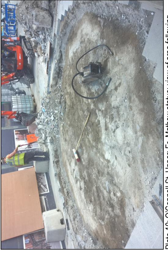
Plate 10: O'Connell St. Upper; Fr. Mathew statue; view of area following removal of foundation.