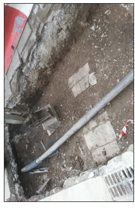
Plate 6: St. Andrew St.; Molly Malone statue new location; post-excavation view of foundation trench, showing stone paving