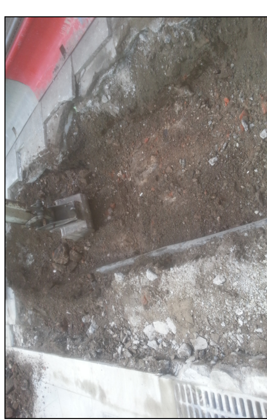
Plate 5: St. Andrew St.; Molly Malone statue new location; new foundation trench under excavation.