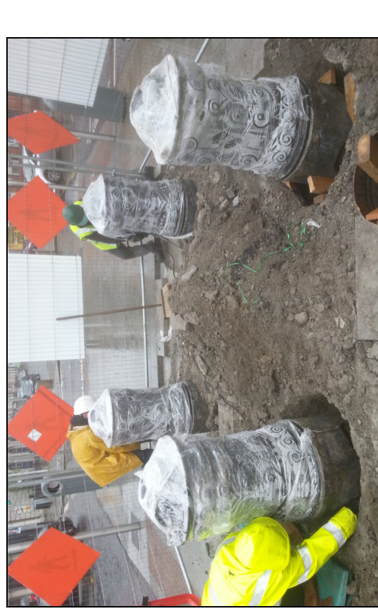
Plate 1: O'Connell St. Upper; Parnell National Monument; removal of fill material from base of bollards